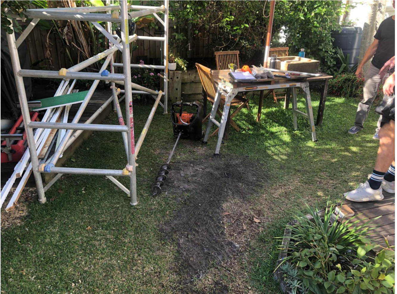
View of the site facing a northerly direction.