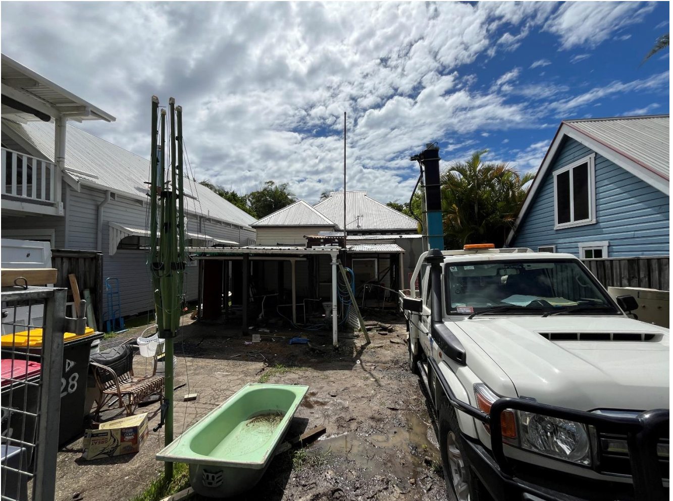
View of the site facing a northerly direction.