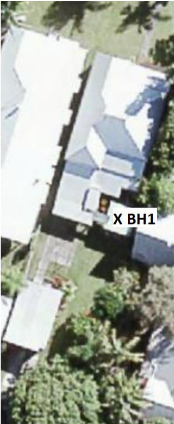
Aerial view of the site, with ASCT test positions.