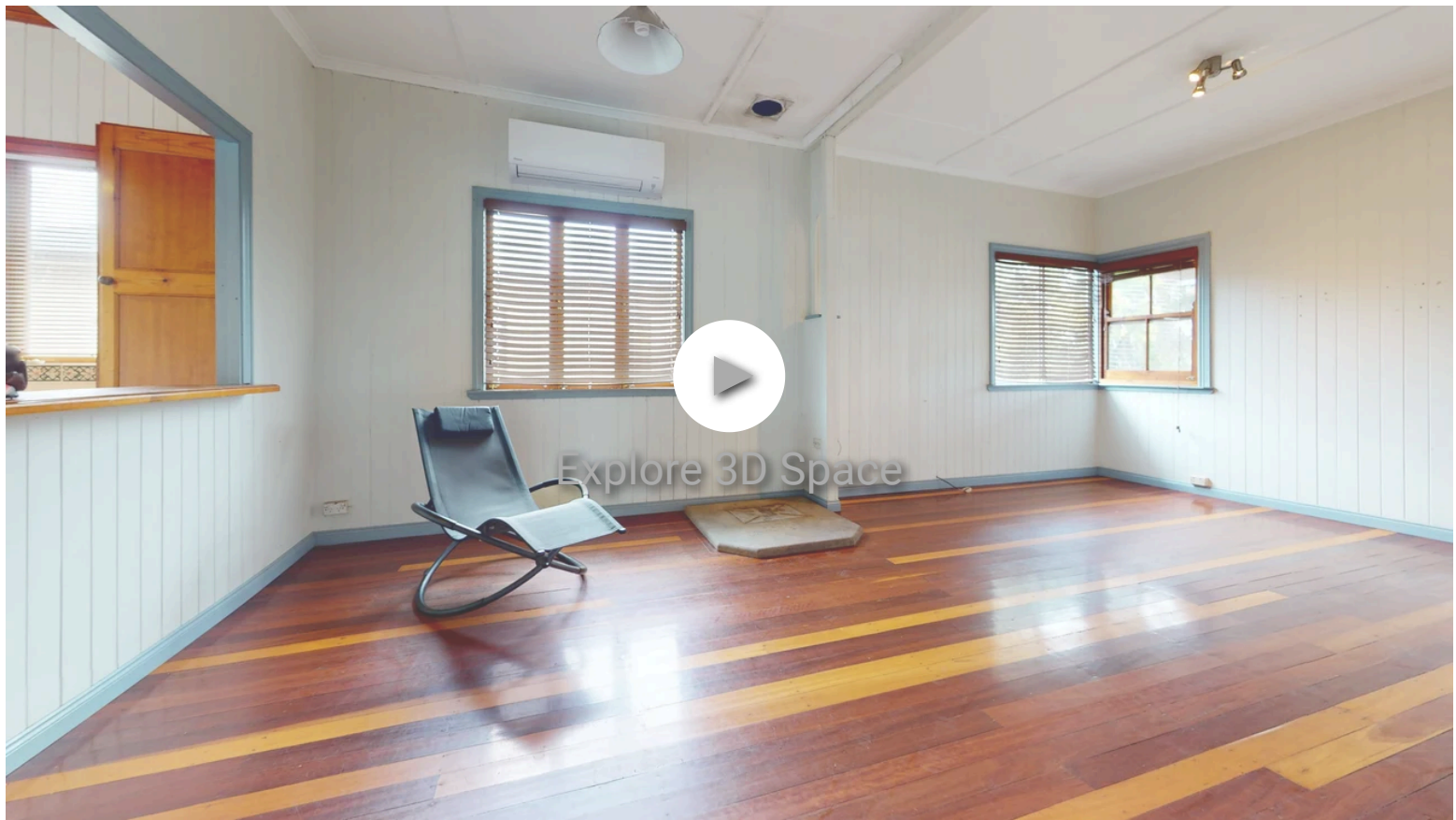
Acacia Ridge copy