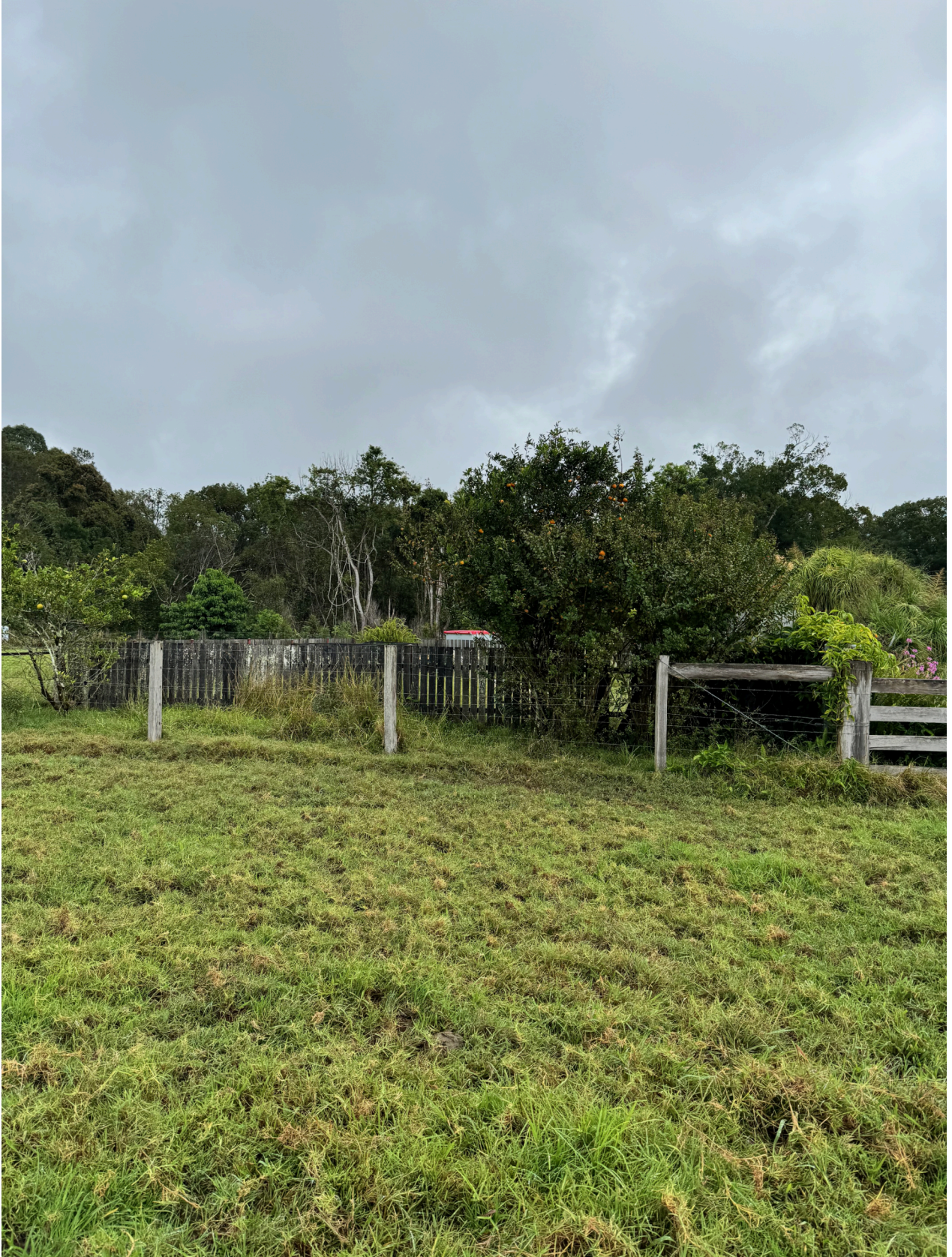
Trees and shrubs south of the existing residence